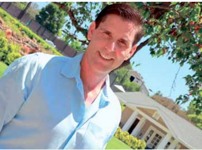
Mark Z. Jacobson

I spoke with Dr. Jacobson about where we are in this enormous effort and what more we need to do. [Lightly edited for space and clarity.]